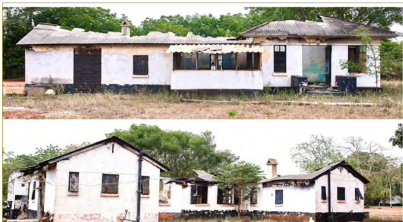
Burnt Out Structure: Behind Clark House

In keeping with our long-held ethos of 'Honouring and Celebrating our Teachers', The OAA 1976 Year Group decided to seek a solution and to do something to plug this gap. The Year Group has embarked on a project which will leverage the availability of vacant land on campus to construct a new build of Teachers' Accommodation. This opportunity emerged from the diligent search and discussions with the school authorities which identified a burnt-out structure, previously a teacher's house, on land that is a great fit for the project's purpose.