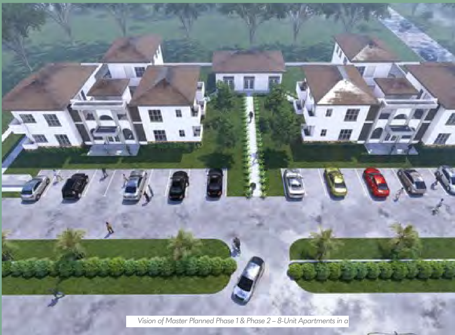
Vision of Master Planned Phase 1 & Phase 2 – 8-Unit Apartments in a