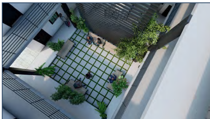
The Atrium: An internal Atrium and Courtyard